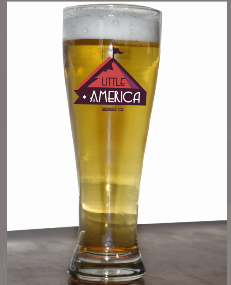
Beer and Shot Glasses